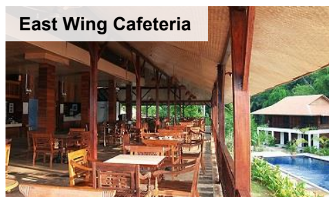
East Wing Cafeteria