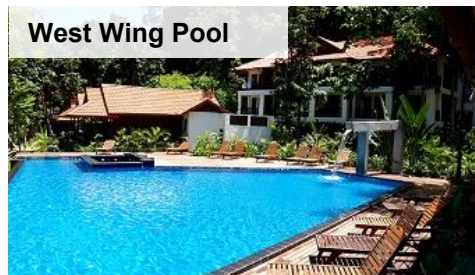
West Wing Pool