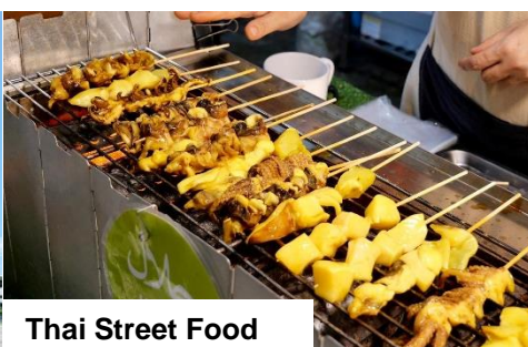
Thai Street Food