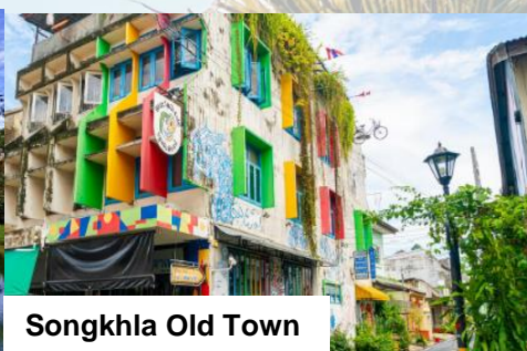
Songkhla Old Town