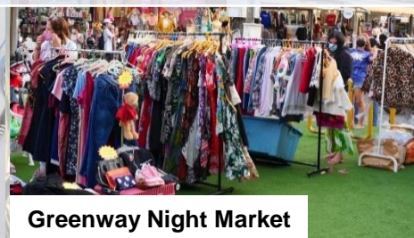
Greenway Night Market