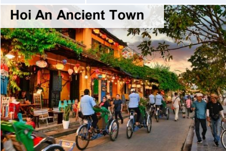
Hoi An Ancient Town