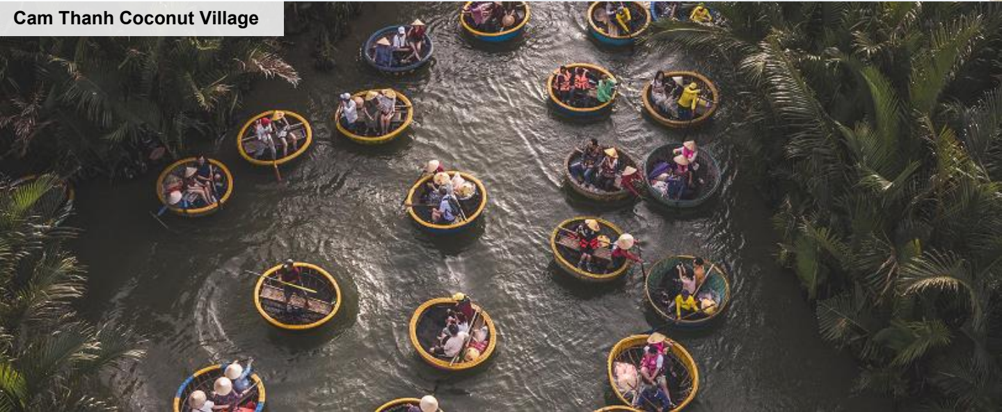
Cam Thanh Coconut Village