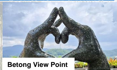
Betong View Point