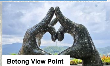
Betong View Point