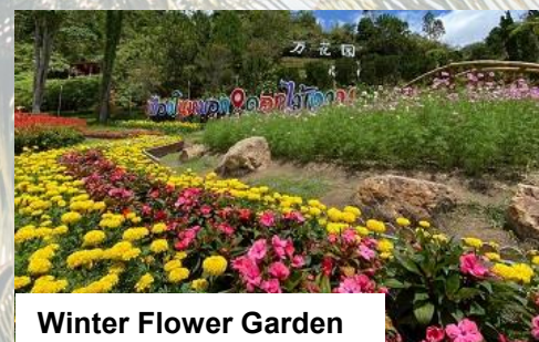
Winter Flower Garden