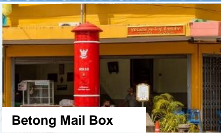
Betong Mail Box