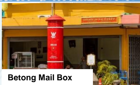
Betong Mail Box