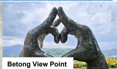
Betong View Point