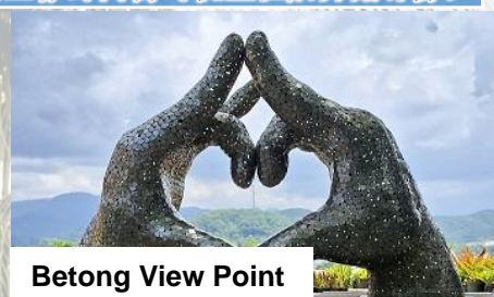
Betong View Point