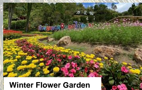
Winter Flower Garden